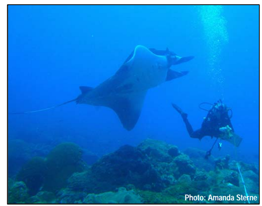
A manta ray swims near a NOAA diver while conducting a fish survey at EFGB.

Although first observed in 2011, 2014 was the second year documenting lionfish ( Pterois volitans/miles ) in the long-term monitoring dataset. Sighting frequency for the species in all surveys was 35%; ranking lionfish the 26<sup>th</sup> most frequently sighted species of 83. These invasive species, known for their voracious appetites, venomous spines and rapid reproduction, can deplete native fish populations at alarming rates from coral reef habitats, and are a direct threat to the FGB.