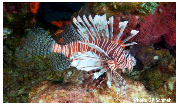
Invasive Lionfish at the FGB.

Fishes were visually assessed by SCUBA divers within the longterm monitoring study sites with modified Bohnsack and Bannerot surveys. The most abundant fish species was the Brown Chromis ( Chromis multilineata ), closely followed by Bluehead ( Thalassoma bifasciatum ). The most frequently sighted species observed during surveys was the Atlantic Creolefish ( Paranthias furcifer ) and Great Barracuda (Sphyraena barracuda). Parrotfish and wrasses, damselfish, and groupers were the dominant fish families observed. Mean fish biomass was highest at WFGB.