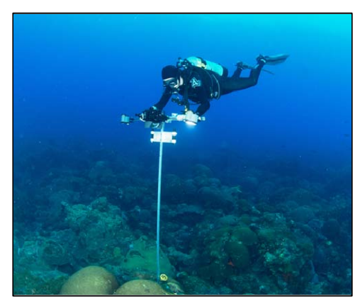
NOAA diver takes a repetitive photo of a coral colony at EFGB.