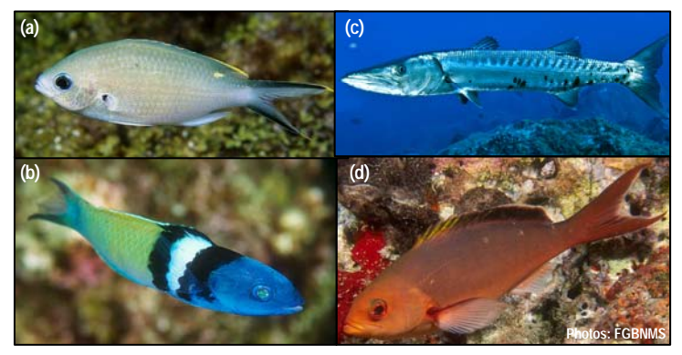
(a) Brown Chromis (b) Bluehead (c) Great Barracuda (d) Atlantic Creolefish.