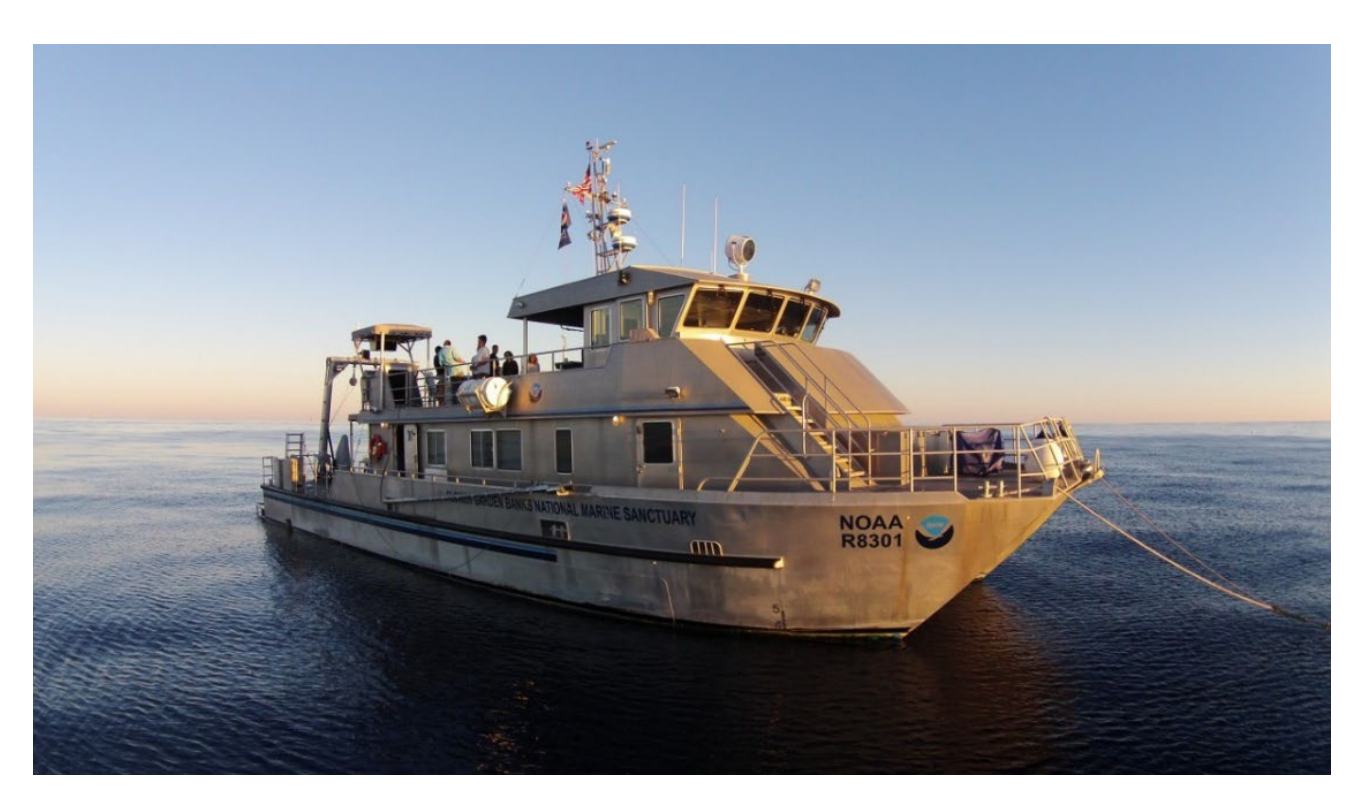
Figure 2. FGBNMS Research Vessel MANTA.

September 25, 2021 – Stetson Bank Monitoring of repetitive photostations and water quality instrument changeout