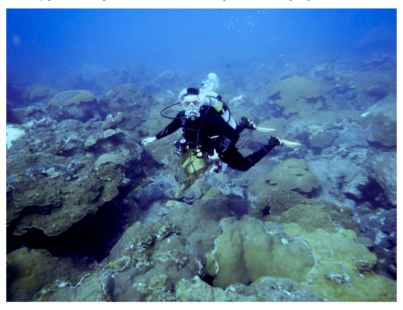
Figure 1. A scuba diver swims above massive boulder coral colonies at West Flower Garden Bank.

The team was involved in three cruises between June 1, 2021 and September 30, 2021. Limited offshore cruises have taken place since March 17, 2020, due to the COVID-19 pandemic restrictions and precautions (i.e., mission approval by regional managers, reduced crew and divers on the vessel, testing requirements, etc.). The team began teleworking in mid-March, 2020 and continued to do so through FY21. Research efforts were primarily focused on supporting FGBNMS boundary expansion, data analysis, and publication and report development. The R/V Manta was utilized by the team for a period of six days to conduct the operations. A pool of 10 sanctuary personnel, scientists, reciprocity divers, and NOAA dive center personnel conducted 65 scuba dives. Ten percent of the dives were conducted by volunteer divers. Activities were focused on mooring buoy installations, water quality instrument changeouts, and collection of long-term monitoring repetitive photographs. Five sanctuary permits were processed and five additional permits were ongoing.