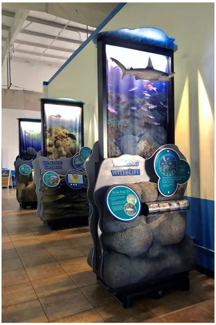
The Reef on the Road traveling exhibit on display in Galveston Cruise Terminal 2.

Cameron Park Zoo (since 2010) and Downtown Aquarium Denver (since 2013) also host video kiosks about the sanctuary. These stand-alone units allow guests to interact via touch screens to learn more about the sanctuary and the wildlife that live there.