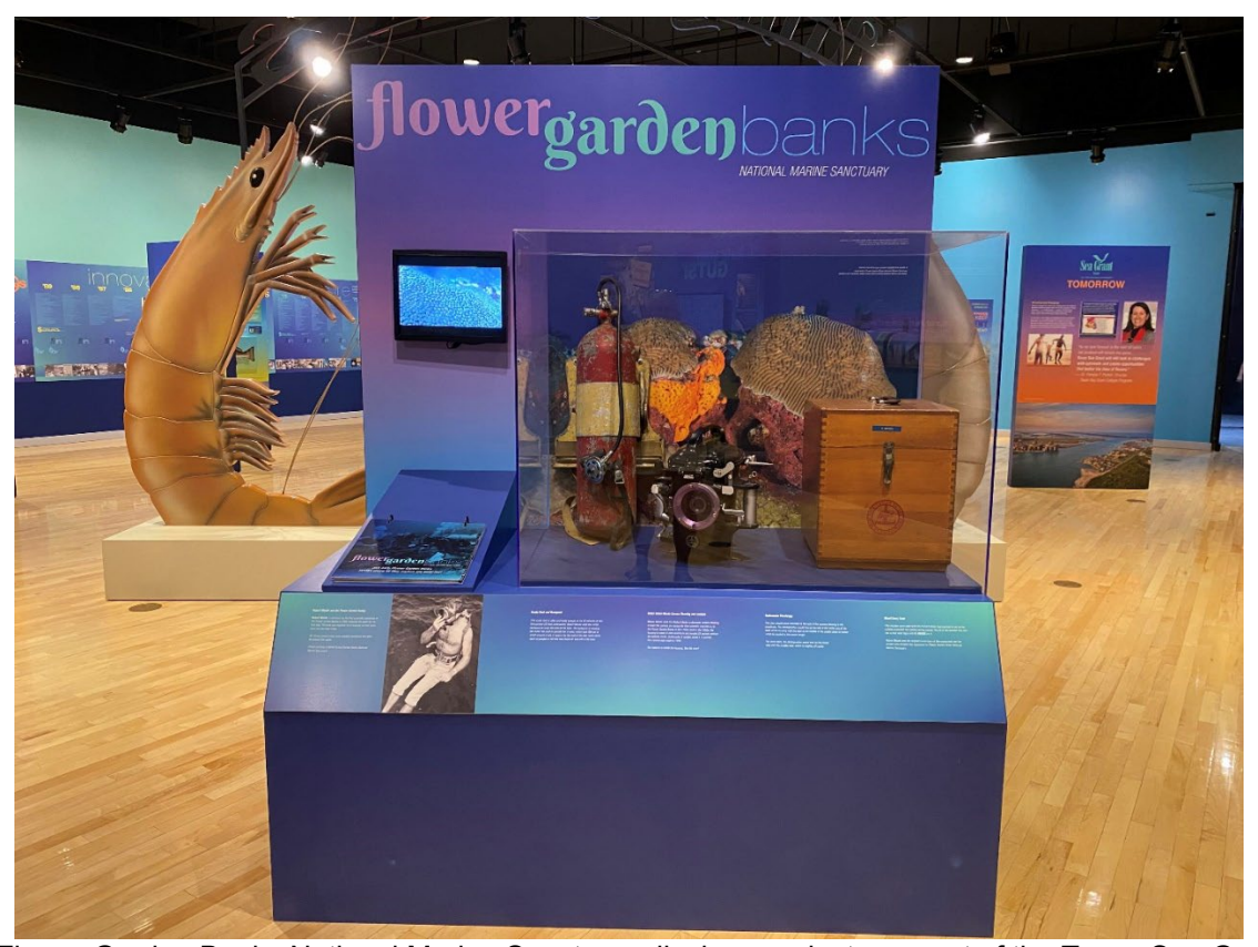
The Flower Garden Banks National Marine Sanctuary display was just one part of the Texas Sea Grant 50<sup>th</sup> anniversary exhibit. It included video footage, a flip book of photos, and dive gear from the 1960s expeditions that first explored the sanctuary.

In April 2019, Texas Sea Grant contacted FGBNMS about the possibility of including the Reef on the Road exhibit as part of a 50<sup>th</sup> anniversary exhibit at the George Bush Presidential Library and Museum beginning in February 2021. Although the group decided not to use the traveling exhibit, they chose to incorporate sanctuary information, images, and historic artifacts in other ways. Following several pandemic-related postponements, the Texas Sea Grant exhibit finally opened to the public in January 2022. The exhibit closed on July 5, 2022.