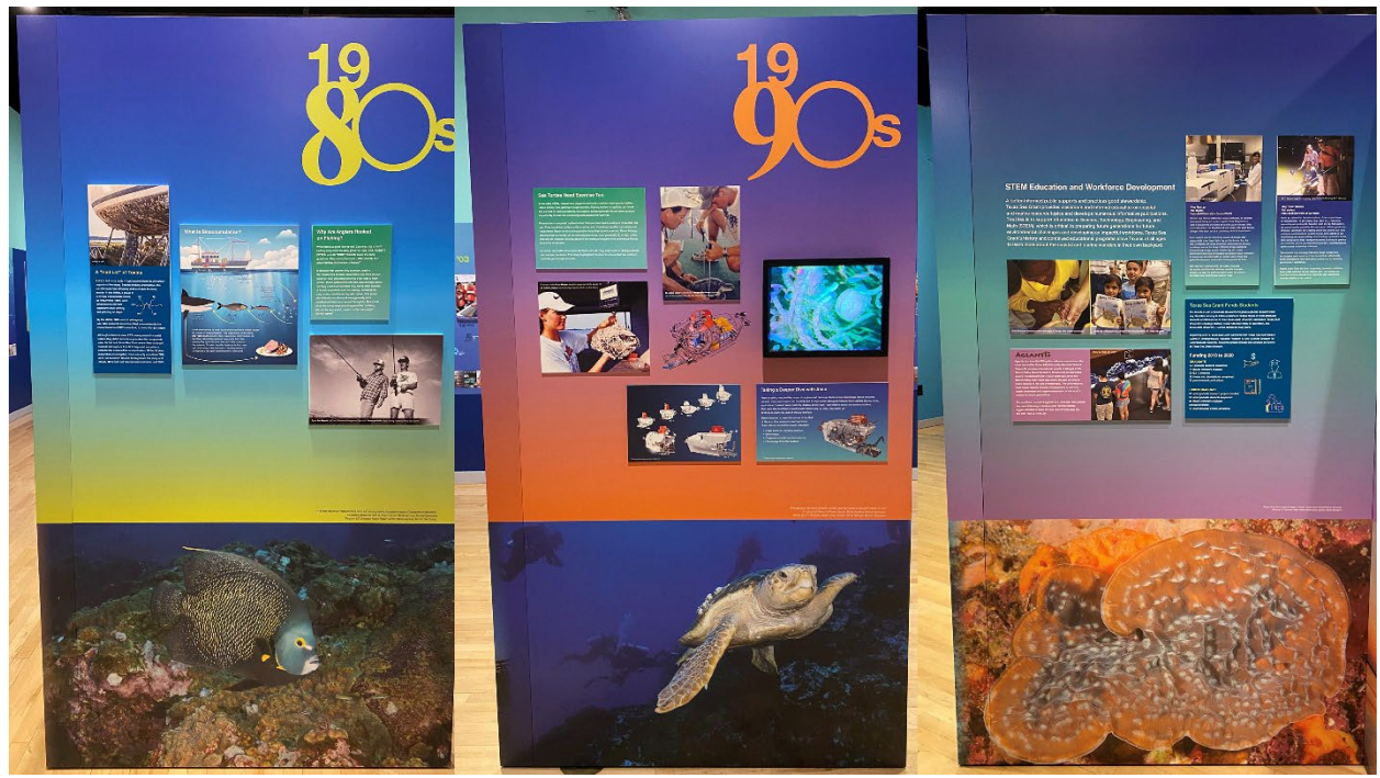
Sanctuary images were also used to illustrate ten display panels throughout the Texas Sea Grant exhibit, three of which are shown here. A large sanctuary image is at the bottom of each panel, along with a credit to the sanctuary.

Visitor numbers for this category represent total visitation at the facilities housing the various exhibits in FY22, not necessarily the number of people who visited the exhibits themselves.