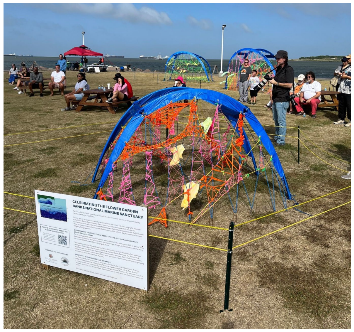
The colorful textiles used to link together the ribs of each berm were designed to glow in the dark to create a different experience for visitors after dark, simulating bioluminescence on the reefs at night.