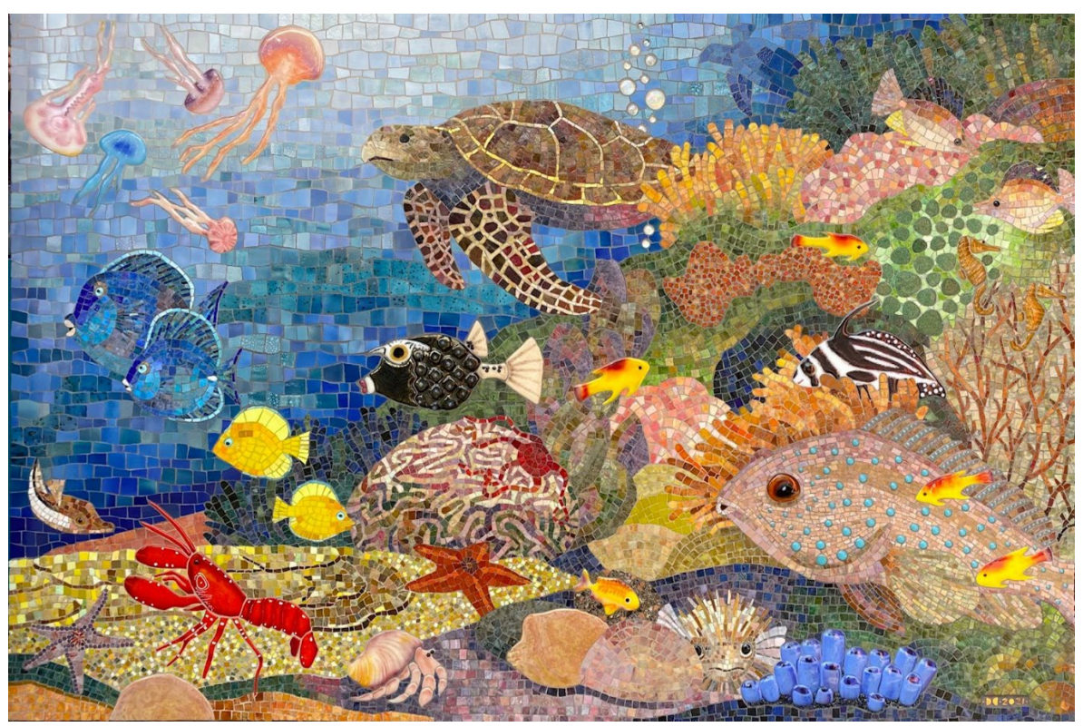
The mural is so large it had to be built in three sections. This is the right end of the mural. The marine life is so realistic that people can identify specific species.