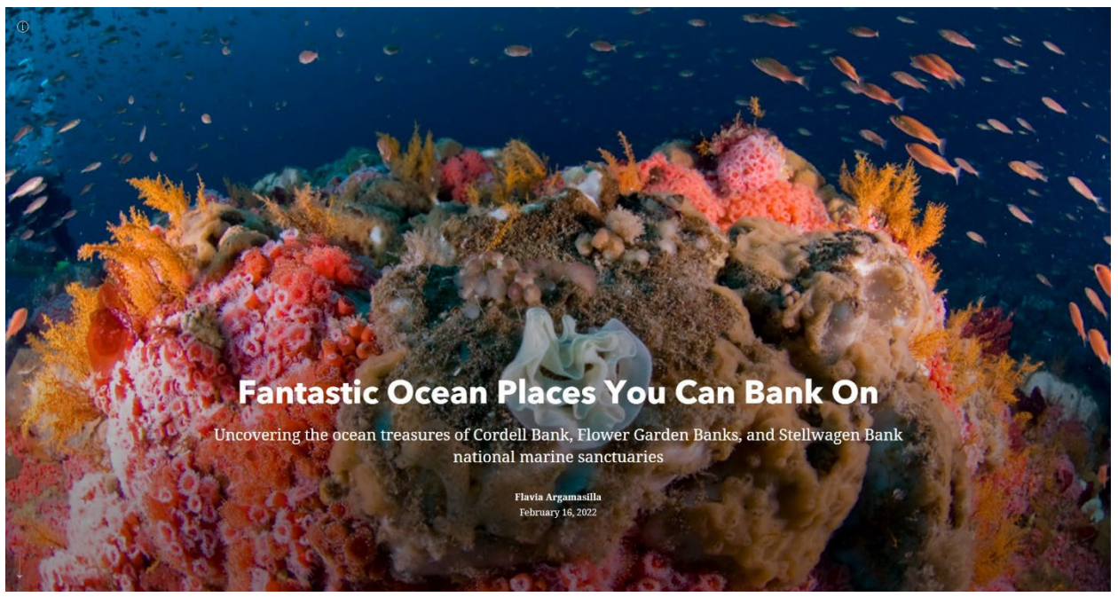
The story map Fantastic Ocean Places You Can Bank On was a collaborative effort of the three sanctuaries with "bank" in their names.