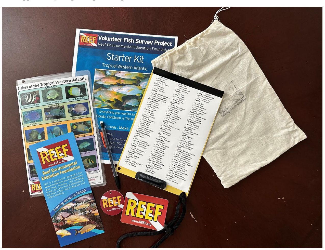
The REEF Fish Survey Project Starter Kit includes a slate with wrist lanyard, underwater survey paper, laminated fish identification card, REEF sticker, REEF luggage tag, instructions, pencil, and pencil holder (to attach to the slate). All items come enclosed in a reusable drawstring cloth bag.

In an attempt to reinvigorate participation in the Reef Environmental Education Foundation (REEF) Fish Survey Project within the sanctuary, FGBNMS collaborated with REEF to update their Flower Garden Banks training module, then offered three Fish ID workshops (two inperson, one virtual). The goal was to help divers and snorkelers build confidence in their fish identification skills and learn how to conduct roving diver surveys. Internal GIYS mini-grant funds were used to purchase fish survey materials for workshop participants, to further encourage survey submissions. Since classes were conducted in June and July 2022, there was little opportunity for participants to put their new skills to use before the end of the dive season.