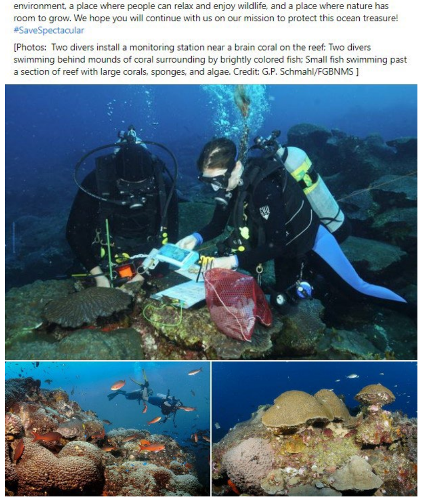
A series of five social media posts highlighted what is so special about the sanctuary, leading up to this celebratory post on January 17, 2022.