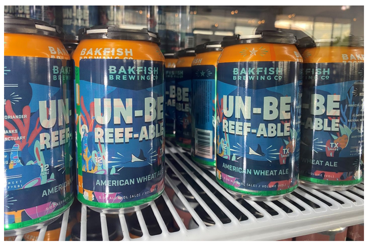
Bakfish Brewing Company's UnbeREEFable beer was created in recognition of the sanctuary's 30<sup>th</sup> anniversary in 2022.

The sanctuary hosted a Cheers to 30 Years event at Bakfish to coincide with the release of this beer on June 4, 2022 (see cover photo). FGBNMS and Bakfish also participated at a second event at Penny's Beer Garden in Dickinson, Texas on July 9, 2022.